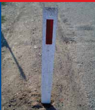
NEW REFLECTOR FITTED