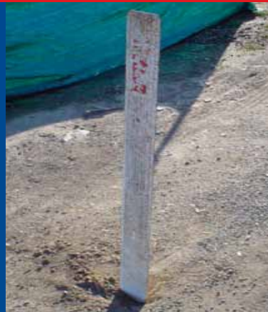
AFTER 1500 IMPACTS