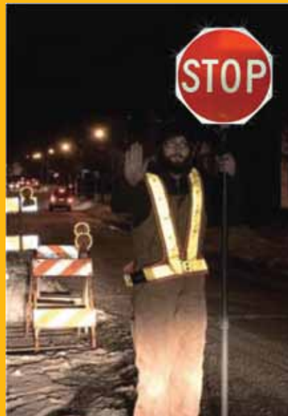
Protect your Work Crews...