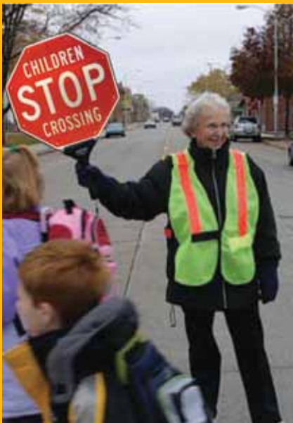
Protect your Children & Crossing Guards...