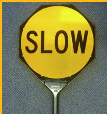
NiMH Battery Powered