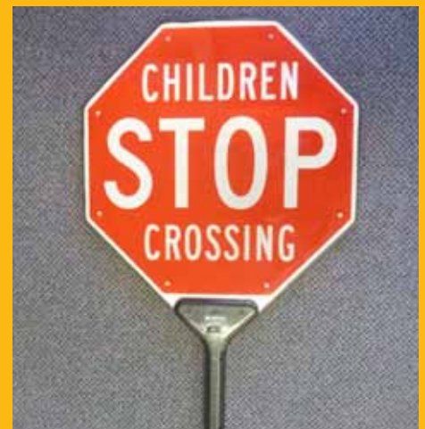
NiMH Battery Powered