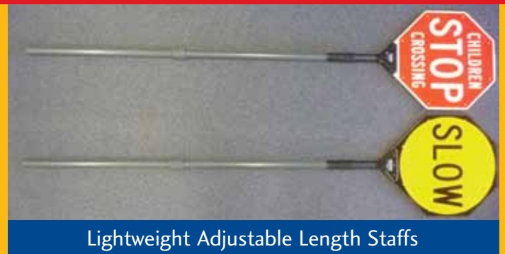
Lightweight Adjustable Length Staffs

Another Premium Road Safety Product from Delnorth